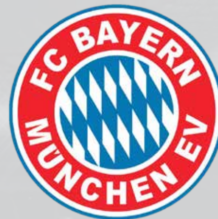
FC Bayern Line-up