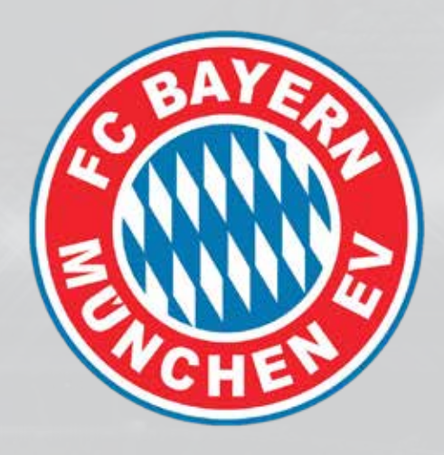
FC Bayern Line-up